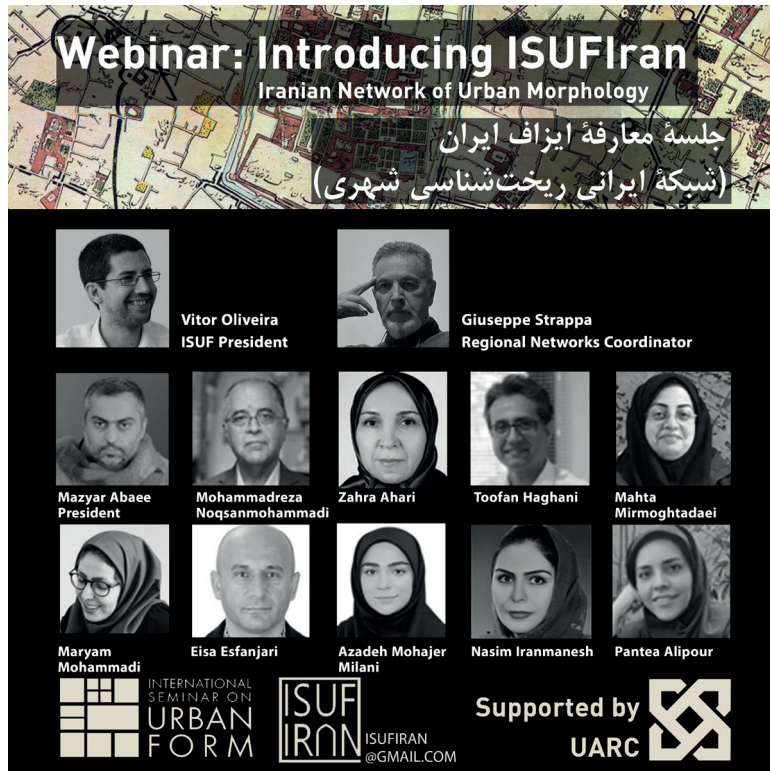
Figure 2. The international introductory session poster on the Iranian network of urban morphology

the newsletter quarterly, representing the society's and the network's activities to disseminate the place and importance of urban morphology as a distinct domain of knowledge and as an instrument to expand the network's borders.